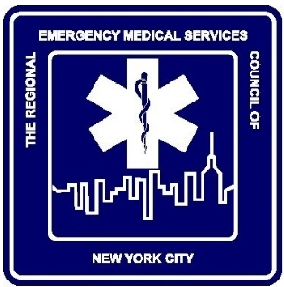
Est. 1974 PREHOSPITAL TREATMENT PROTOCOLS